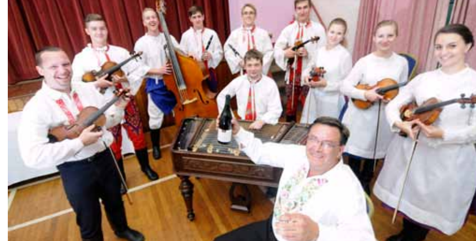
THAT'S ENTERTAINMENT: Czech band Notecka perform at Preston Arts Festival